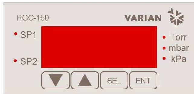
Figure 2 Front Panel