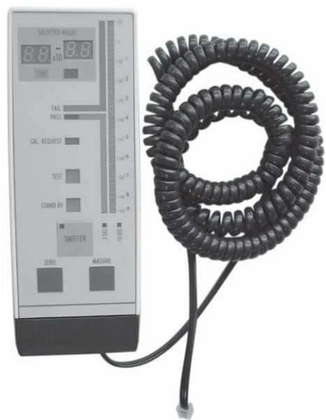
Fig. 3: Special sniffing remote control

The special sniffing remote control for sniffing leak detectors must be used only with the ASM 102 S and ASM 142 S.