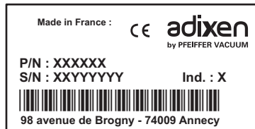
Fig. 1: Identification label