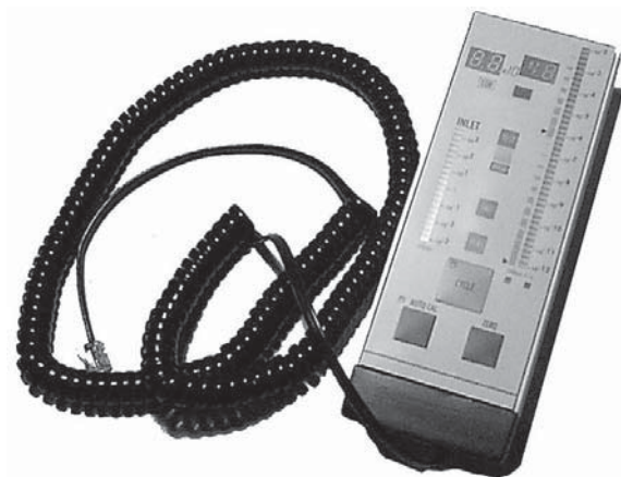
Fig. 2: Standard remote control

The standard remote control can be used with all the ASM xxx leak detectors, excepted the ASM 102 S and ASM 142 S.