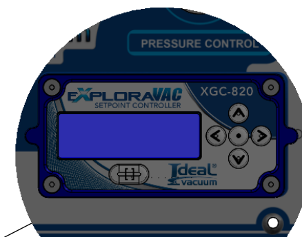
DETAIL A SCALE 1 : 2