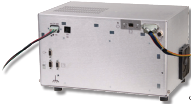
Only two cables required