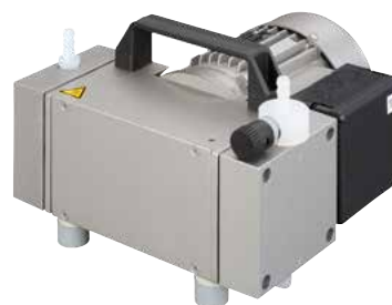
Model MPC 601 E

Specifications & Ordering - p. 36, 38, 39