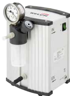
Model MPC 090 E