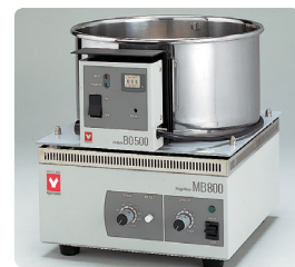
BO500 + MB800