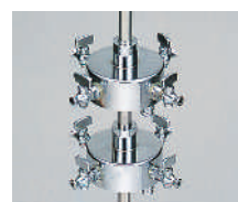
Cooling water distributor for BS400

Includes distribution pipe 2pcs., connector 4pcs., 2pcs.=1set (supply/drain). One connected to water faucet will inject water to 4 cooling water distributors.