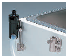
Easy to change water level by adjusting over flow