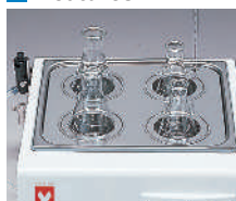
For different flask size