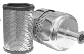
P/N P101878 $165.00