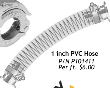
1 inch PVC Hose P/N P101411 Per ft. $6.00