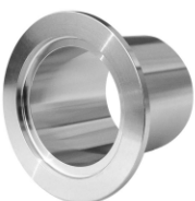
KF25 Half Nipple P/N P101218 $14.25