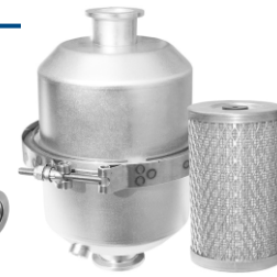
P/N P102029 $315.00