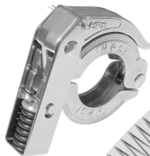
KF25 Toggle Clamp P/N P101638 $13.25