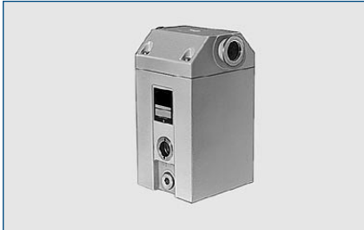
AF 4-8 exhaust filter

Exhaust filters retain oil mists and aerosols.