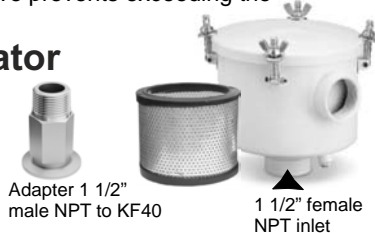
Adapter 1 1/2" male NPT to KF40 1 1/2" female NPT inlet requires adapter male 1 1/2" to KF40 for use on Alcatel 2033 or 2063 vacuum pumps

material: ..... body: carbon steel canister with 1/4" drain cap, inlet port: 1 1/2" P/N P102588 weight: ..... 5 lbs. Parent Flow 50 CFM Price.....$295.00 Adapter 1 1/2" inch to ISOKF40 P/N P101604 Price.....$126.00 Replacement Cartridge (single): P/N P102626 Price.....$48.50