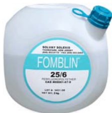
Fomblin A113 PFPE Synthetic Fluid P/N P102130 P/N P102132 1kg $186.87 8kg $1495.00