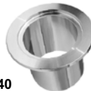
KF40 Half Nipple P/N P101220 $16.15