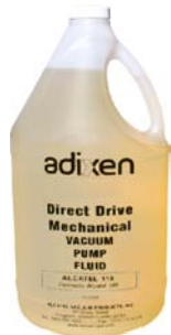
Alcatel 119 Oil P/N P102102 1 Gallon $29.00