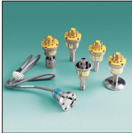
Thermocouple Gauge Tubes