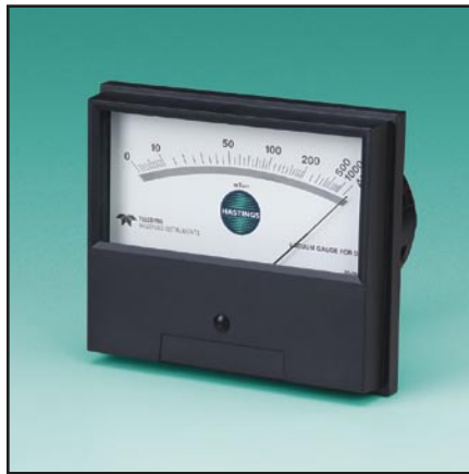
Vacuum Gauge Meters/Controllers