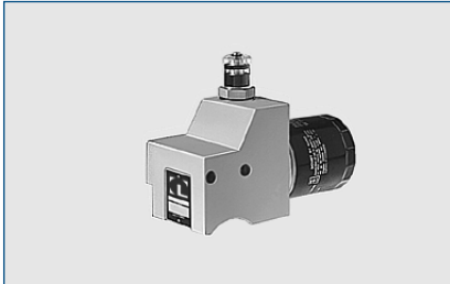
OF 4-25 mechanical oil filter

Since there is a pressure-lubrication system with an oil pump in every TRIVAC B, it is possible to connect main flow oil filters.