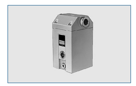
AF 4-8 exhaust filter

Exhaust filters retain oil mists and aerosols.