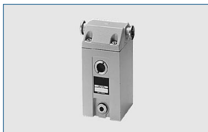
AK 4-8 condensate separator

Separators protect the pump against condensate.