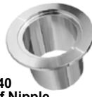
KF40 Half Nipple P/N P101220 $16.15